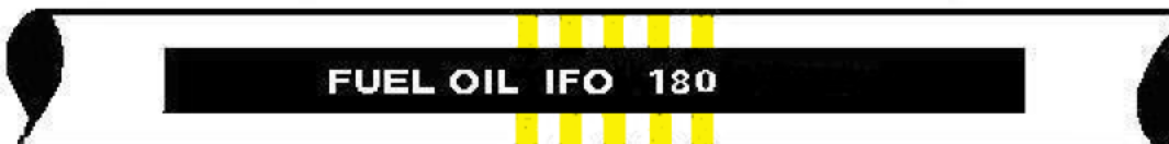
FIGURE 5. HEAVY FUEL (BLACK) OILS--FIVE NARROW BANDS