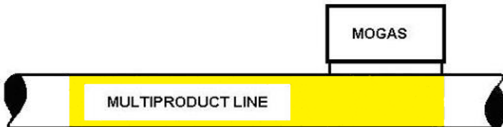
FIGURE 10. MULTIPRODUCT LINES