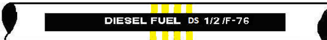
FIGURE 4. DISTILLATES--FOUR NARROW BANDS