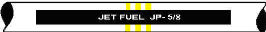
FIGURE 3. JET FUELS--THREE NARROW BANDS