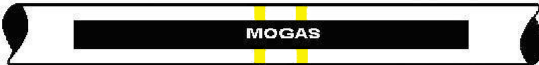
FIGURE 2. AUTOMOTIVE GASOLINES--TWO NARROW BANDS