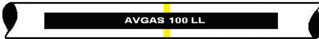
FIGURE 1. AVIATION GASOLINES--ONE NARROW BAND